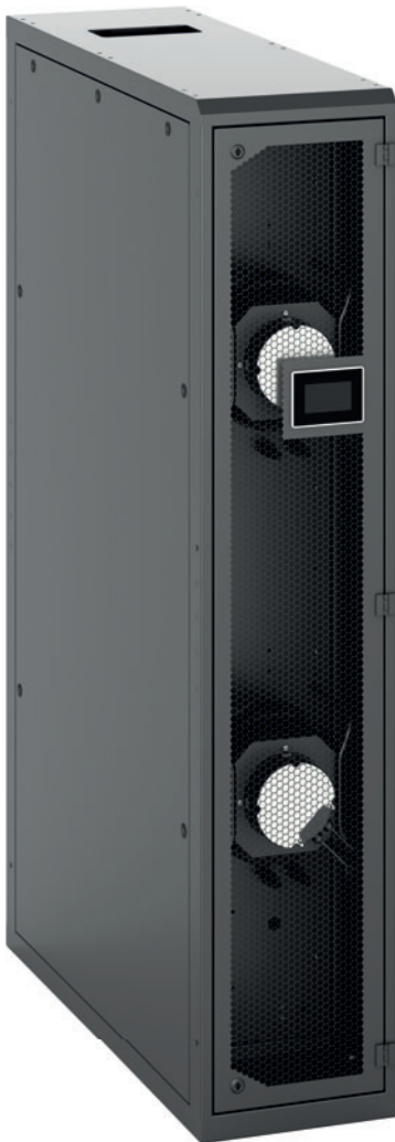
CoolTeg Plus DF

➤ CoolTeg Plus DF cooling units combine the advantages of CW and XC systems—free-cooling for low and medium outdoor temperatures and direct expansion cooling for use during high outdoor temperatures. The system thus reaches optimal minimum operating costs without the need to compromise.